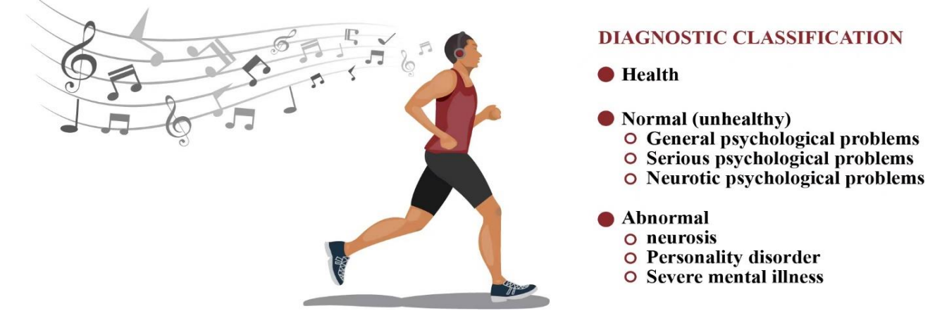
Figure. 1 Problems of college student athletes' mental health